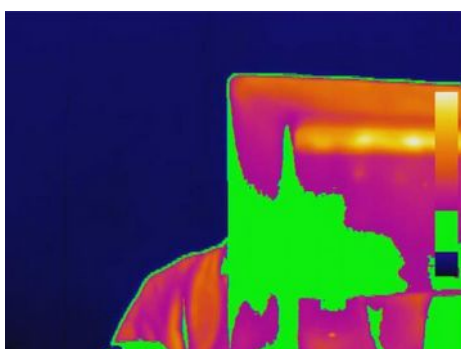
Advanced analysis: Isotherm feature