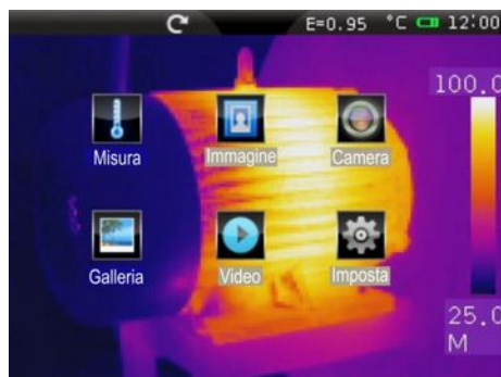
General menu with icons

The THT70 model is an advanced infrared camera with capacitive touch-screen TFT color display for quick and intuitive advanced use by any kind of thermograph operator