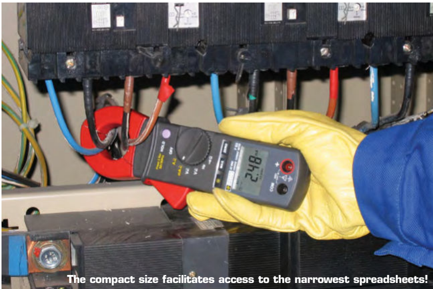
The compact size facilitates access to the narrowest spreadsheets!

For testing and maintenance professionals in the industrial and tertiary sectors faced with this challenge, F62-F65 pocket-sized clamps are the recognised solution, while providing the full range of functions proposed by conventional multimeter clamps.