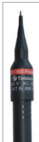
Attachable test probe CAT III (not suitable for Ex-application)