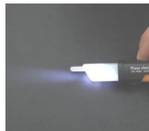
White LED torch

This instrument satisfies the requirements of Low Voltage Directive 2014/35/EU (LVD) and of EMC Directive 2014/30/EU This instrument satisfies the requirements of 2011/65/EU (RoHS) directive and 2012/19/EU (WEEE) directive