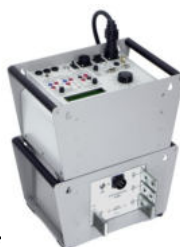
PCUI-SP and NLU5000

The unit has two outputs, allowing injection of currents as low as a few hundred milliamps and up to 750A. Voltages up to 16V are available on the 40A output, allowing higher impedance trips to be tested. Four true RMS metering ranges are provided, allowing the full scale of the meter and trip level to be set independently of the selected output. The metering has a capture time of less than 20ms, allowing the rms of a single cycle to be accurately measured. Industry standard connectors are used on all inputs and outputs for convenience, reliability and safety.