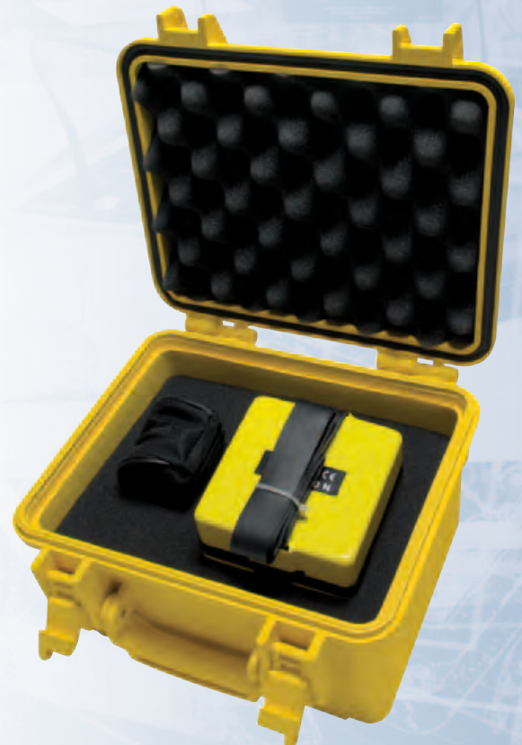
IMEG 500N / IMEG 1000N