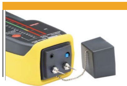
Replaceable electrodes (L = 12 mm)