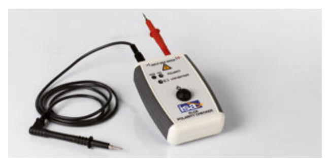
PLCK polarity checker

Checking the correct connection of CT's and VT's to protection relays is a problem because relays can be hundreds of meters away from the transformer. PLCK easilys solves the issue. When this test is started, DRTS 33 generates a special, not sinusoidal waveform, which is injected into the connection cables. The polarity check is easily performed by connecting it at the relay site. PLCK hast wo lights: green and red. The green light turns on when the polarity is correct; the red light turns on when the polarity is wrong.