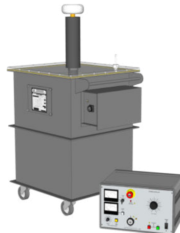
KV100-100 mk2 10kVA system

If higher voltage or output power is required, please refer to our KV50-200 mk2/KV100-100 mk2 data sheet, detailing our 10kVA high voltage systems.