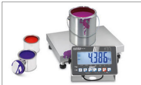
Durable stainless steel weighing plate