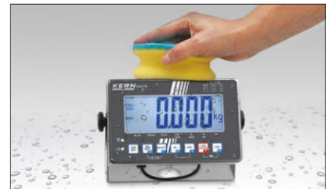
Stainless steel display device with IP68 protection , hygienic and easy to clean Benchtop stand incl. wall mount for display device as standard, for details see KERN KXS-TM