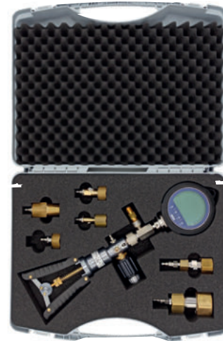
Calibration system, model BCS10