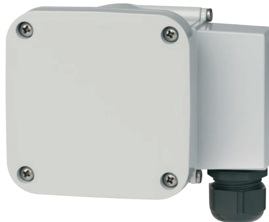
Gas density switch with reference chamber, model GDS-RC-HV