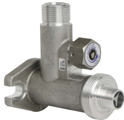
Gas-leak-tight Connection model GLTC10 - 3-way combination valve