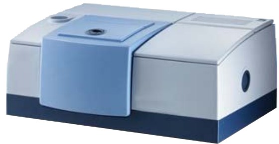
Measuring system for laboratory analysis, model GFTIR-10