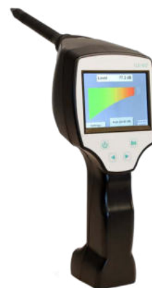
ILD 450 with straightening tube and straightening tip for accurate detection.